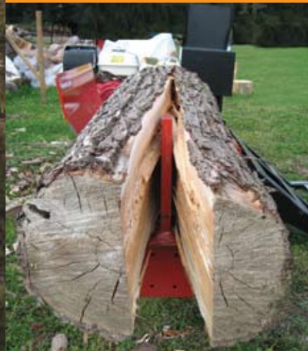
Above // Log fuel can be produced and burnt using 'low-tech' equipment

Of all woodfuel options logs require least processing. Ideally logs should be less than 10 cm in diameter to aid drying; this also helps burning because wood is a poor conductor of heat. The boiler or stove dimensions will determine log length. At a domestic scale logs should be moved under cover in autumn to prevent water reabsorption. It is an advantage to bring logs indoors a few weeks prior to use to become 'house dry'.